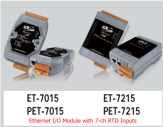
ET-7015 ET-7215 PET-7015 PET-7215 Ethernet I/O Module with 7-ch RTD Inputs